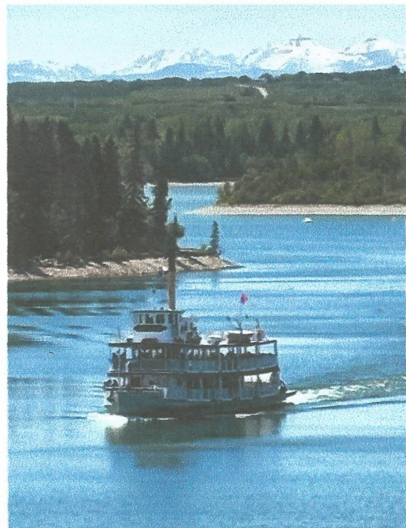
SS Moyie Paddle-Wheeler

There are many things to do in and around Calgary. In the city there is a Zoo, an Olympic Museum, the Bell Canadian Music Museum, Trout Fishing, Calgary Tower, Military Museums and more.